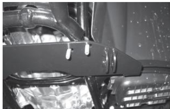
Figure 6 - Check U-Bolt Position

6. Place the plow mount back into position on the vehicle. Slide the u-bolts (B1) down around the frame tubes and through the slots in the mounting plate, figure 6. Check the position of the u-bolt in the slot. Remove the plow mount after the u-bolt orientation has been noted.