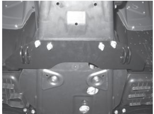
Figure 8 - U-Bolt Check

8. Loosely fasten the skid plate onto the vehicle. Repeat steps 2 and 3 to loosely fasten the plow mount. Slide the two u-bolts (B1) around the frame tubes and through the skid plate and plow mount, figure 8. Loosely fasten the u-bolts with the four 5/16. flat washers (B2) and four 5/16-18 lock nuts (B3).