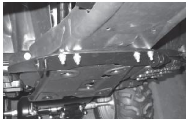
Figure 9 - Plow Mount Installed

9. Tighten all hardware (M6 skid plate bolts, 5/16-18 lock nuts, M8 bolts, and M8 nuts) to the recommended torque values found on page 2.