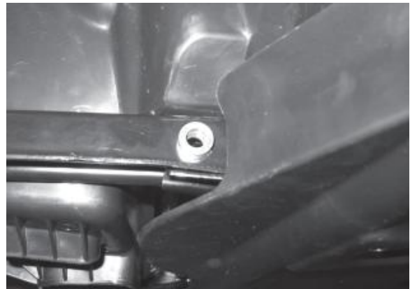
Figure 2 - Position Spacers

2. Place the M8 spacers (B5) into position over the floorboard bolt holes, figure 2.