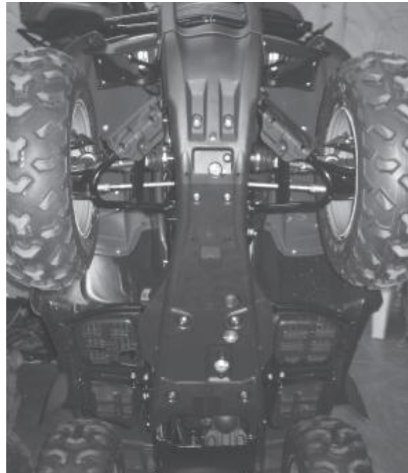
Figure 5 - Remove Plastic Skid Plate

5. Remove the twelve M6 bolts securing the stock plastic skid plate and remove the skid plate, figure 5. Keep the M6 bolts for reassembly.