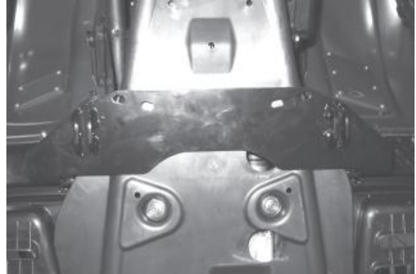
Figure 4 - Mark Plow Mount Slots

4. Center the plow mount on the vehicle. Mark the plow mount outline and slots onto the plastic skid plate with a center punch or similar pointed object, figure 4.