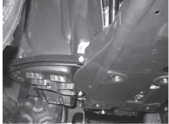
Figure 1 - Remove Bolts

1. Remove the two outer M8 floorboard bolts. figure 1. Keep the M8 nuts for reassembly.