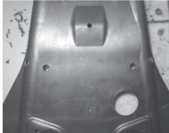
Figure 7 - Skid Plate Holes

Note: If the u-bolts do not pass freely through the plastic skid plate, then remove the plow mount and skid plate. Use a round file to enlarge the holes for the u-bolts as necessary. Repeat step 8 once the holes have been adequately modified.